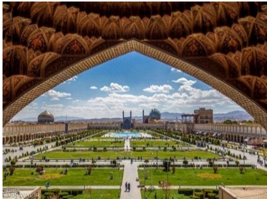
Naghsh-e Jahan Square(Isfahan Province-Isfahan)