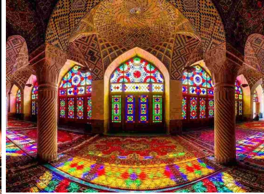
Nasir Al_Molk Mosque(Fars province- Shiraz)