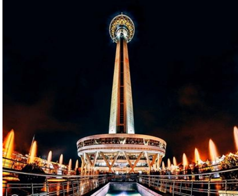
Milad tower(Tehran Province- Tehran)