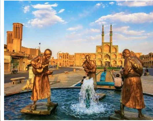
Amir Chakhmaq Squire(Yazd Province- Yazd)