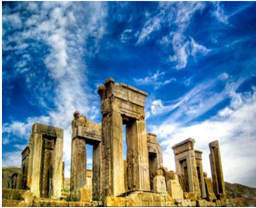
Persepolis(Fars Province-Shiraz- Marvdasht)