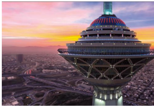
Milad tower(Tehran Province-Tehran)