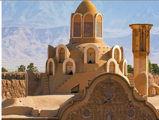
Boroujerdi House(Isfahan Province-Kashan)