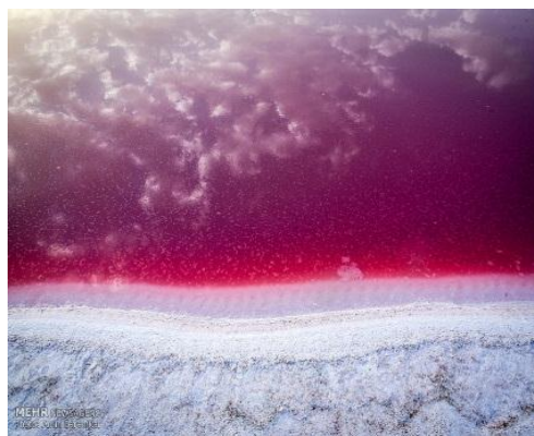
Maharloo Lake(Fars province)