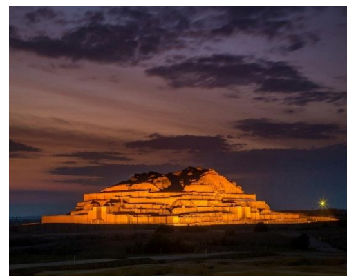
Chogha Zanbil(Khuzestan Province-Shush)