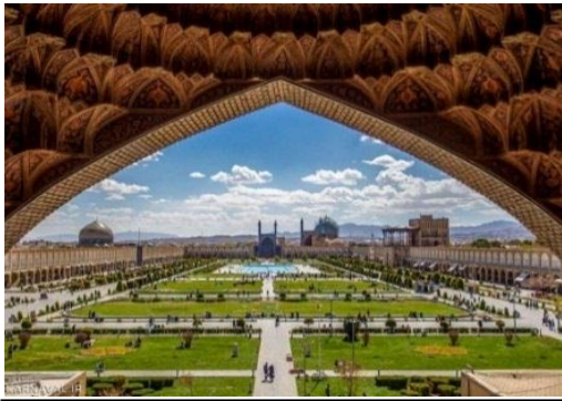
Naghsh-e Jahan Square(Isfahan Province-Isfahan)