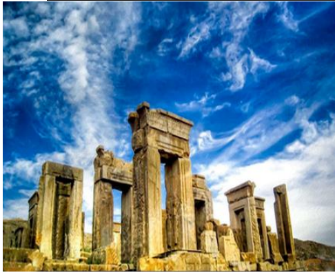
Persepolis (Fars province-Shiraz-Marvdasht)