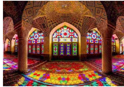
Nasir Al_Molk Mosque(Fars province-Shiraz)